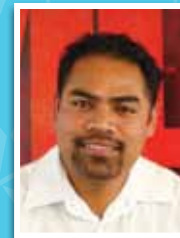
1. Kilisimasi Seg Auckland, NZ